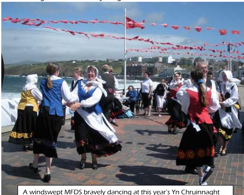
A windswept MFDS bravely dancing at this year's Yn Chruinnaght