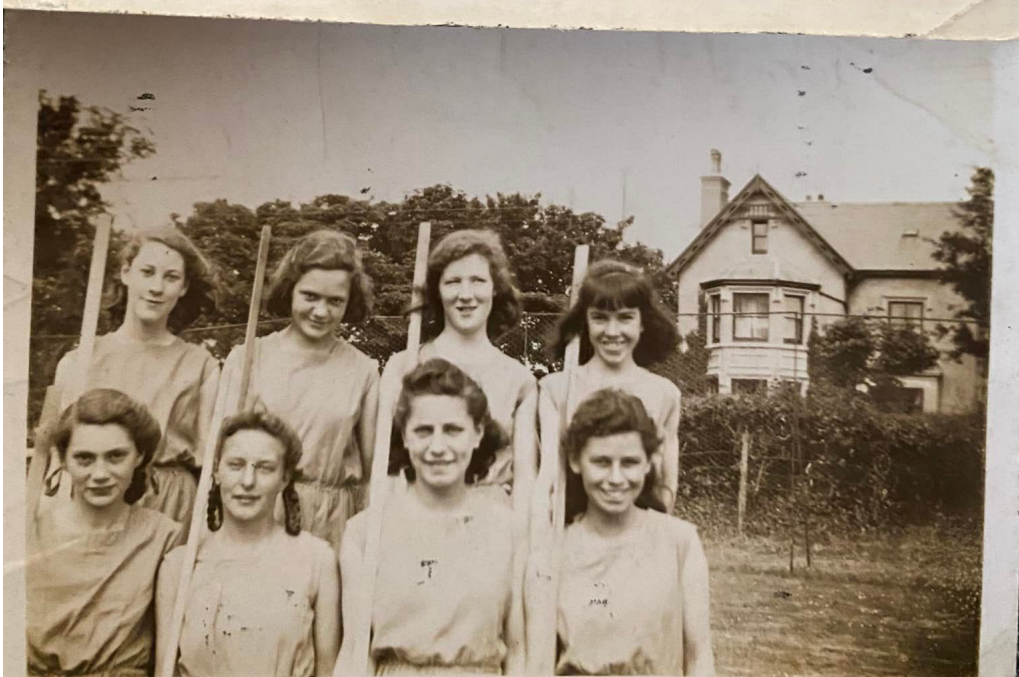
RGS Girls Sword Dancing Team 1948