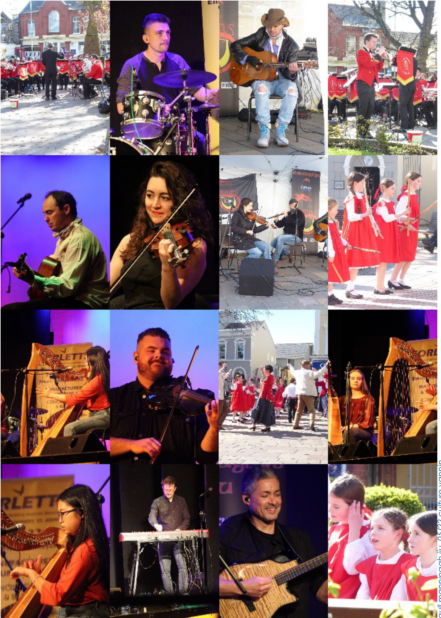
kiavll manninagh jiu 05/22 culture vannin