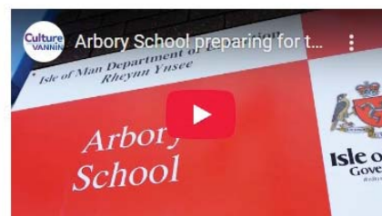
Preparing for the Manx Folk Awards (Longer edit)

The films are all available on the Culture Vannin website and on our YouTube channel: