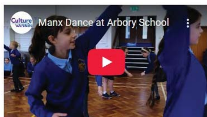
Manx dancing at Arbory School

"It was a privilege to be a part of the filming in the school, watching the positivity and enjoyment which the children and staff got from their coming together to practise Manx music, song and dance. It was clear how enriching and positive the experiences were, which is exactly why we made the films – to show how exciting it all is!"