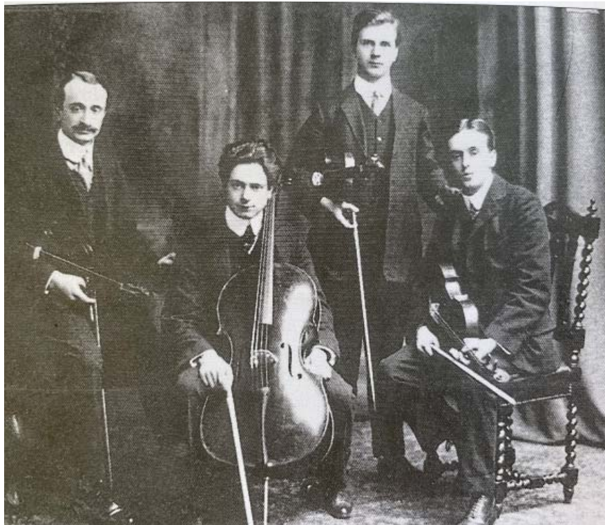
PHOTO: The Hambourg String Quartet, Capetown 1908.