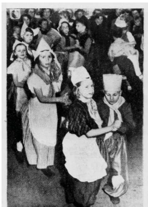
Children at Kirk Michael Primary School performing a genuine Dutch folk dance at the Dutch Bulb afternoon on Tuesday.