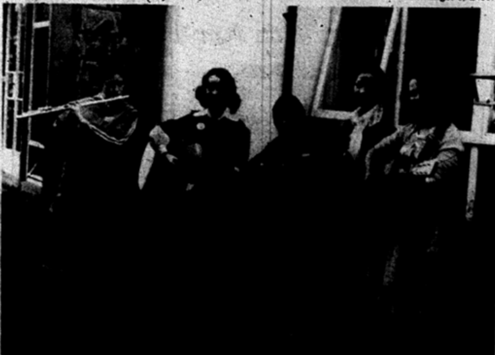
Members of Ny Mooinjer Veggey, the Manx group who will perform at the Pan Celtic competition in Killarney.

Thanks to a further effort in Ramsey last Saturday, organised in association with the Royal and Ancient Order of Buffaloes, Ny Mooinjer Veggey have now passed their star target of £400.