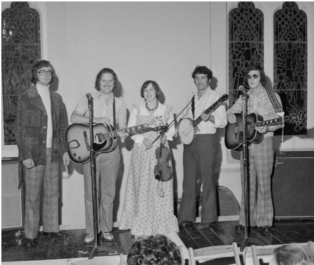
Mannin Folk performing in St Paul's Hall, September 1975.