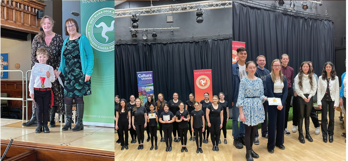
Highlights from this year's MFA awards. See more: https://tinyurl.com/3y66tysm