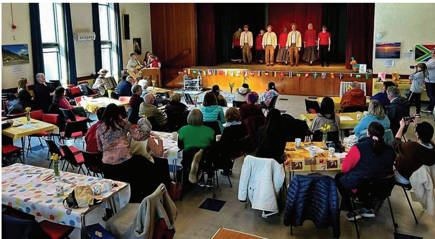
Perree Bane danced at Cafe Lingo's Springfest in Douglas last month. More photos: www.facebook.com/groups/manxmusicanddance/permalink/10161530071992417/