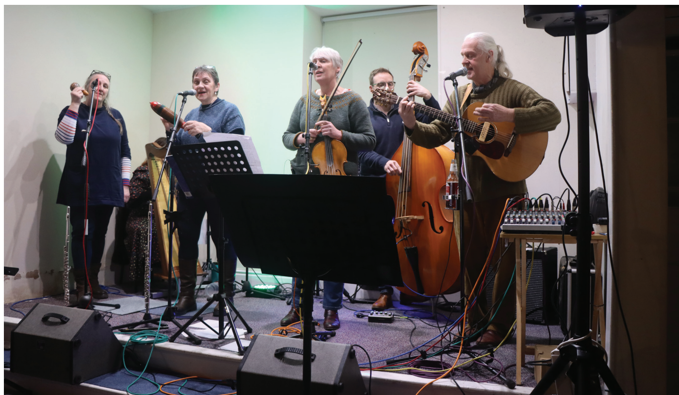
The Mollag Band played in the Sailor's Shelter last month.

Isle of Man Trad Weekend back in 2024, by popular demand. September 20th to 23rd 2024.