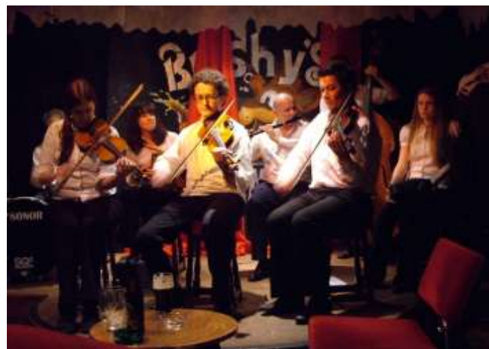
Photo of the Isle of Man Ceilidh Band

The band would like to thank all who have supported them along the way, including the Isle of Man Arts Council, the Manx Heritage Foundation, as well as Comhaltas Ceoltoiri Eireann in Monkstown.