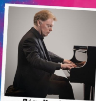
Tim Horton Thursday 29th June